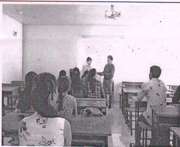
Felicitation of guest by H.O.D.